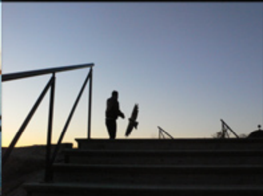
The Crow , kite made of plastic sheet and bamboo, photographs, etc, 2007