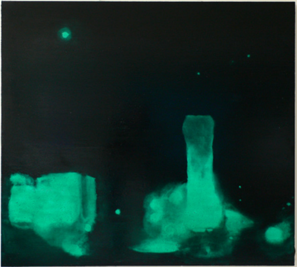
Bagdad by night , oil and alkyd on canvas, 2005