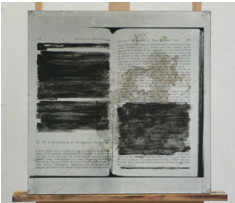
Egoism and Individualism, serigraphy on metal covered wood plates, 2006